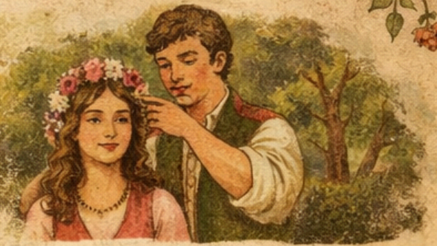
Crowning the May Queen